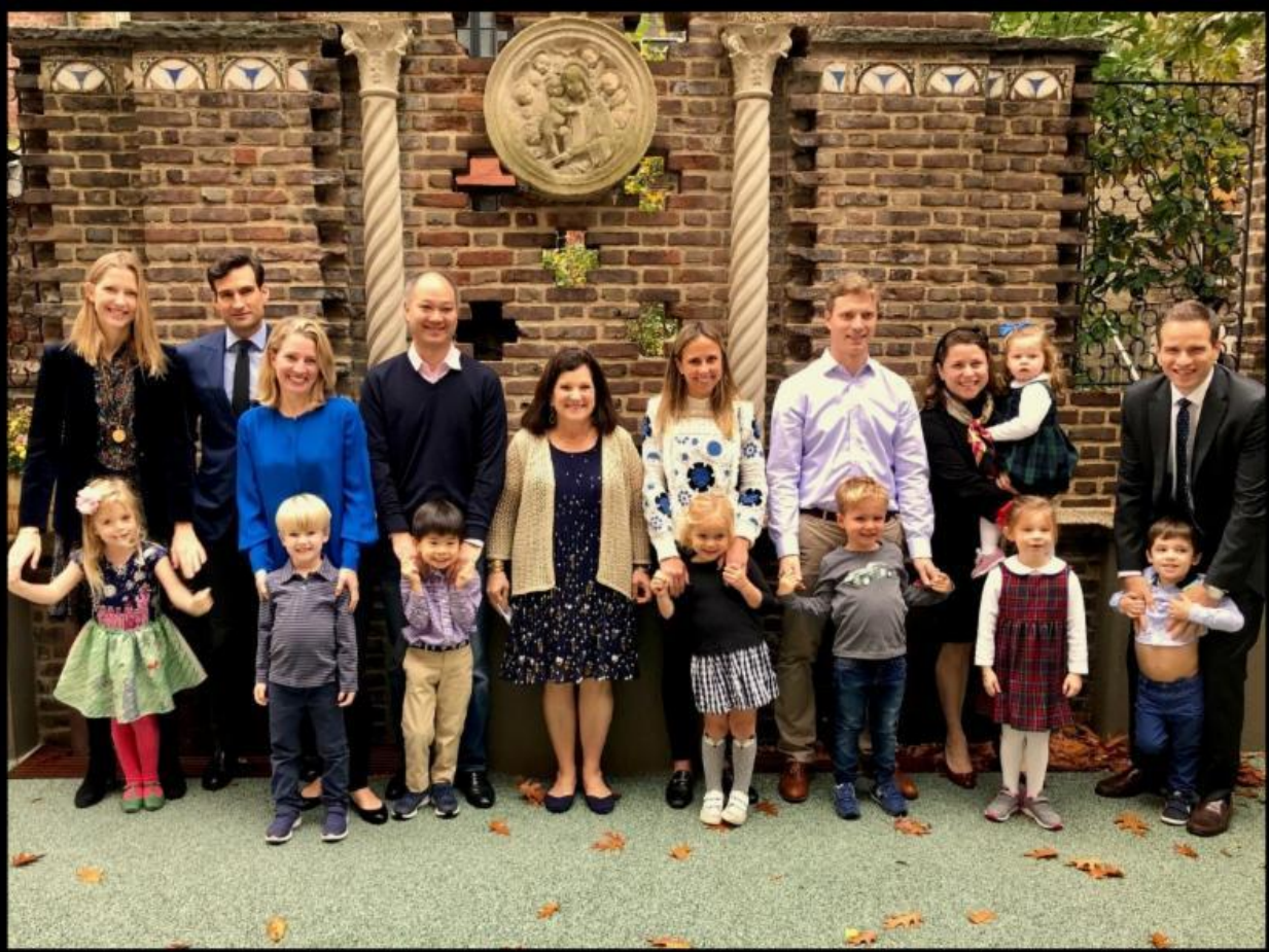
2018-19 Alumni Parents and children (from left to right):